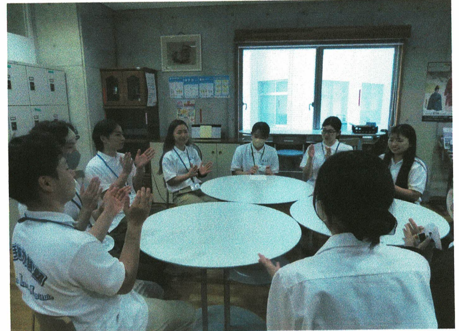
KLI and Kadena High School students share experiences.